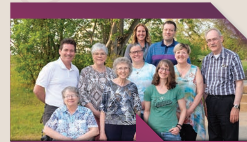
Graduates of the 2019 diocesan Lay Formation program, which now has a new name: the Adult Faith Enrichment Program.

"Lay Formation has been a life changing experience.... We have drawn closer to God through community and fellowship, we have learned how to pray, and how to minister to other people."